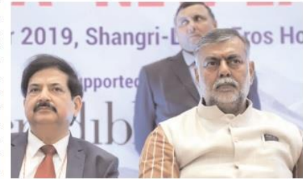
कार्यक्रम में भाग लेते हुए पर्यटन राज्य मंत्री प्रहलाद सिंह पटेल।

गतव्य स्थल के बारे में सबसे अच्छी बात ये है कि वे गुणवत्ता वाले पर्यटन को प्रोत्साहित करने की हच्चा रखते हैं जो ये दर्शाता है कि वे अपने गंतव्य स्थल को कितनी परवाह करते हैं। हम भी लेह लद्दाख में साहसिक पर्यटन के लिए एक पूरी तरह से सुसज्जित सुविधा सह प्रशिक्षण केंद्र का प्रस्ताव रखते हैं और साथ ही ये प्रस्ताव रखते हैं कि क्या लेह लद्दाख में