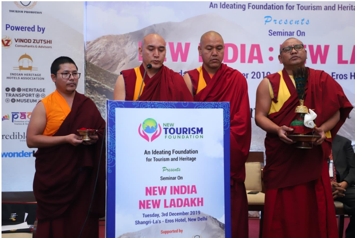
Invocation by the Buddhist monks