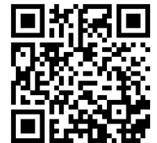
Scan to hear